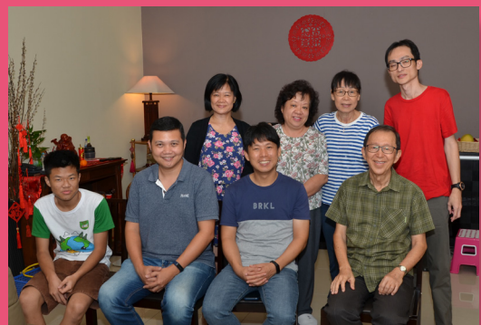
何烈山小组 Horeb Home-cell