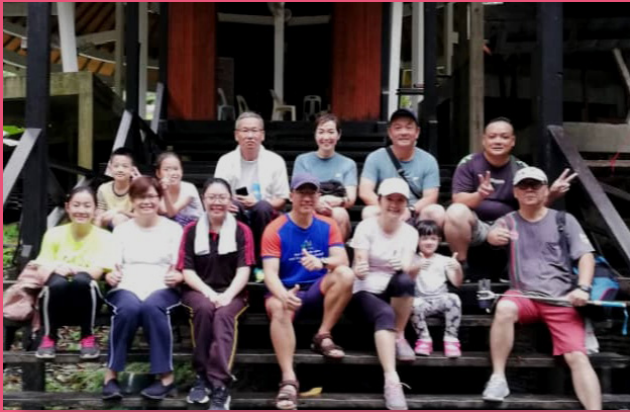
隐基底小组 En-Gedi Homecell