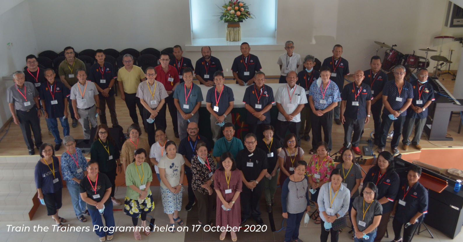
Train the Trainers Programme held on 17 October 2020