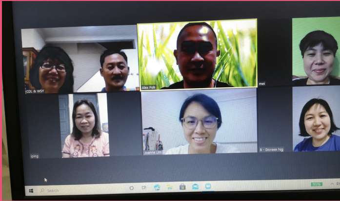
摩利亚小组 Mt. Moriah Homecell